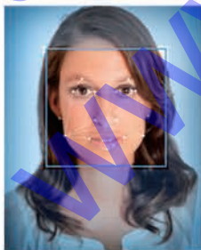
AI face recognition