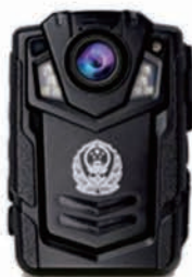
Body worn camera